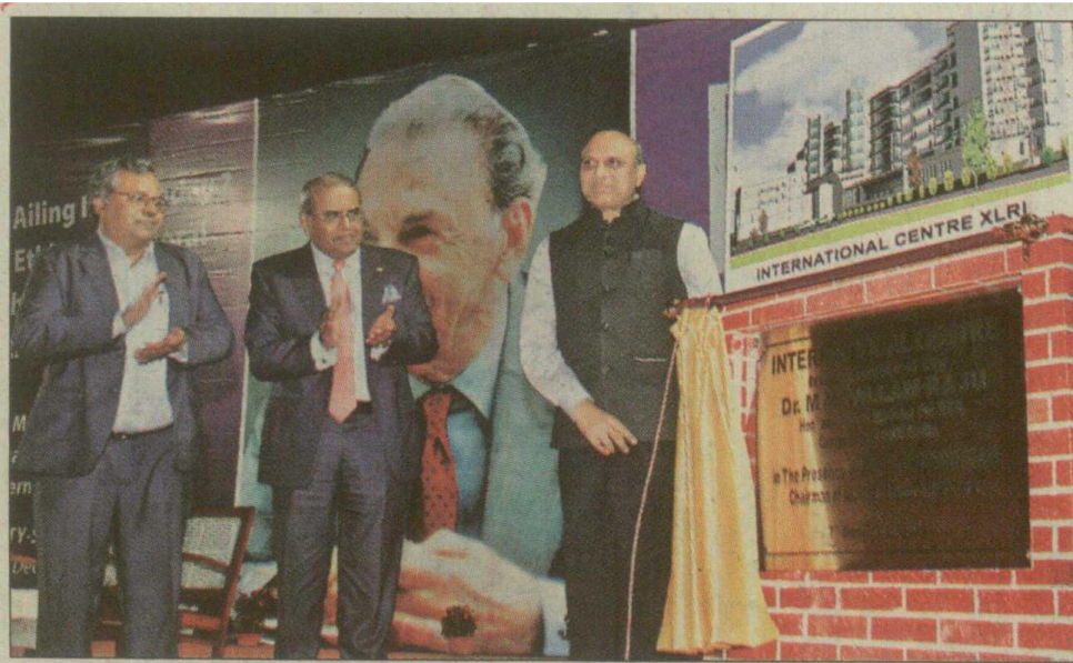
■ Union HRD minister MM Pallam Raju (Right) unveils the foundation stone of the International Center of XLRI at Tata Auditorium in Jamshedpur